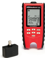
T130 Tester Only