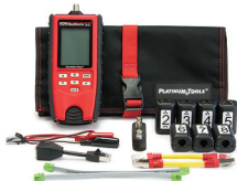
T130K2 Pro Kit

(20 Network ID-only remotes, adapters, cables and hanging pouch)