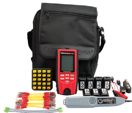
T130K3 Pro Kit

(8 Test-and-ID Smart remotes, adapters, cables and hanging pouch)